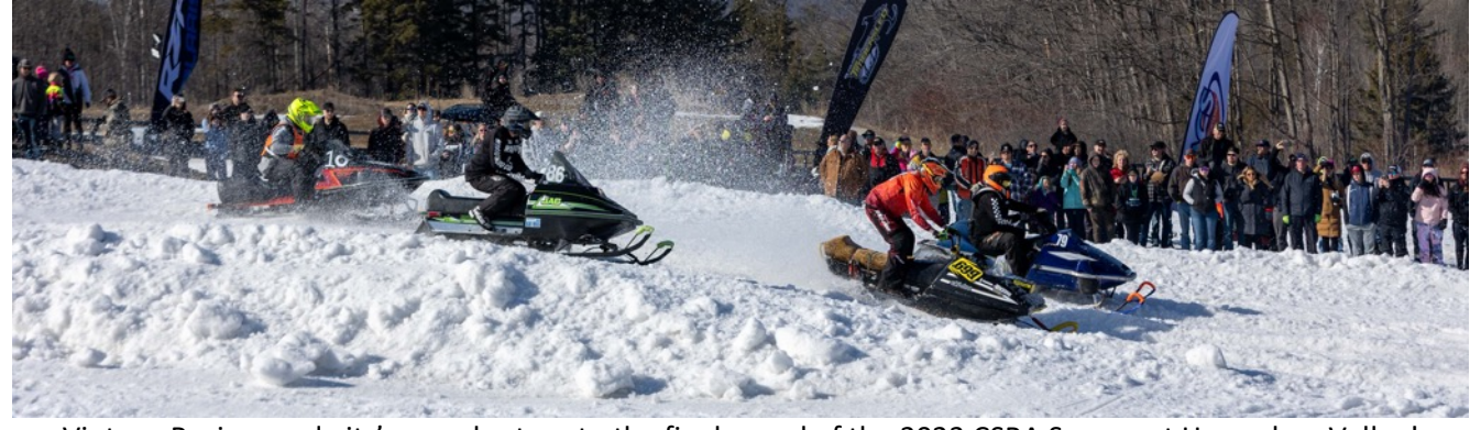
Vintage Racing made its' annual return to the final round of the 2023 CSRA Season at Horseshoe Valley!

Sunoco Race Fuels, Ultimax Performance Belts by Timken, OSM On Snow Magazine, FXR Racing, Royal Distributing, Motul Lubricants, True North Motorsports, Tom Smith Chevrolet Buick GMC, Stud Boy Traction Products, Edge Performance, St-Onge Recreation, Giesler Marine, OTSFF Sports Marketing, C&A Pro Skis, Vision Wheel, Black River Racing, Team Vincent Motorsports, Caliber, Woody's, ACS Powersports, JD Racing, Algonquin Equipment, Sheppard Racing, Team Gelinas, Sault Ste. Marie, Action Trailers, HB Cycle, Mikey's General Sales, Bailey Motorsports, Lee Plumbing, Polito Ford Lincoln, Rigid, Tekrider TekVest, Cyclone Motorsports, Clean Media, ATV World Magazine, Bayside Chrysler Dodge Jeep Ram, BRP Ski-Doo, Can-Am, Polaris RZR, TIMBERSLED, Polaris Industries Canada and Backcountry Motorsports Media