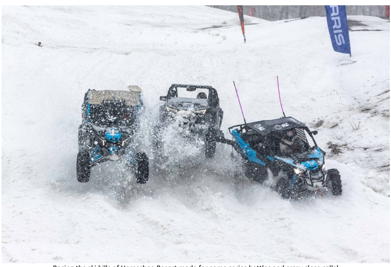
Racing the ski hills of Horseshoe Resort made for some series battles and crazy close calls!