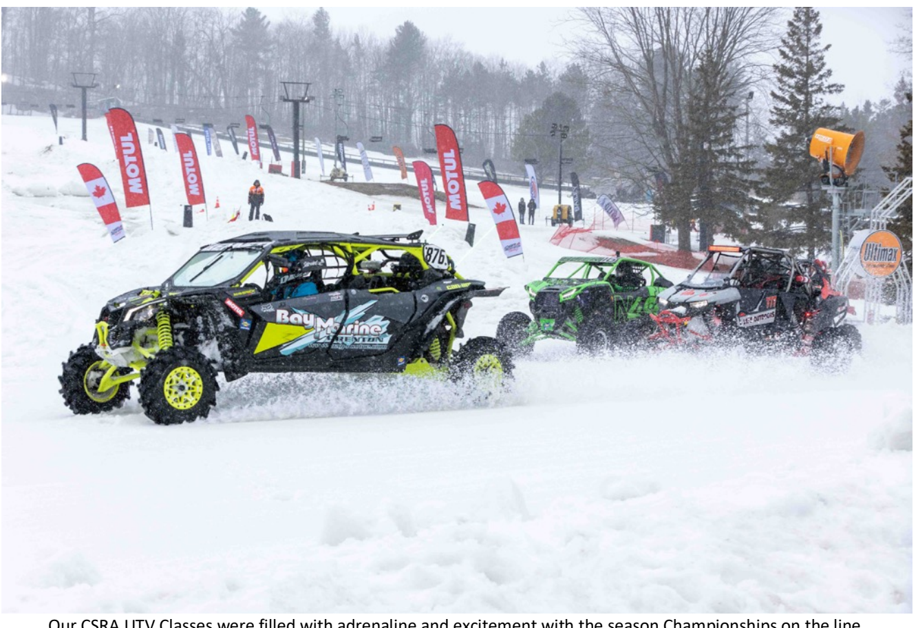
Our CSRA UTV Classes were filled with adrenaline and excitement with the season Championships on the line.